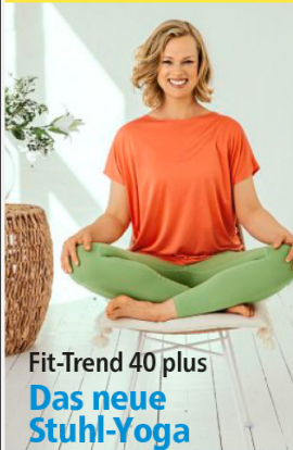
Fit-Trend 40 plus