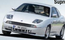
Fiat Coupé 20V Turbo