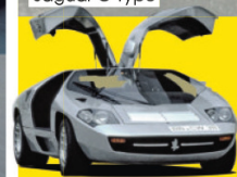
SPORTWAGEN-ABC Die Isdera-Historie