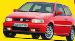
VW Polo GTI