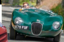
VORBILD LE MANS Jaguar C-Type