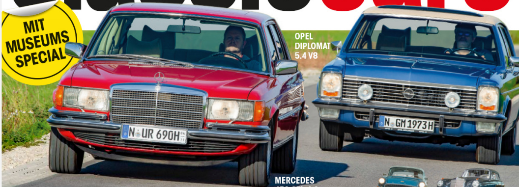
OPEL DIPLOMAT 5.4 V8